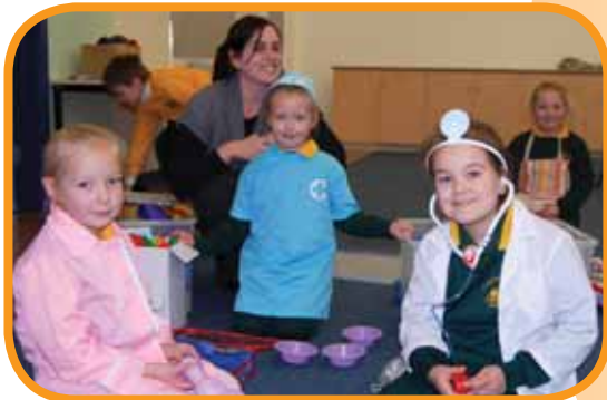
Our program offers activities to stimulate your child's imagination

Our staff tailor the activities to suit the children in our care